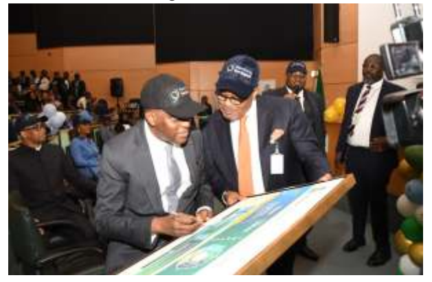
Governor CBN and the Director, Strategy Management Department during the event